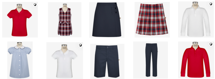
PK4 & Kindergarten uniform option

Note: Logo not needed on polos worn under jumpers.